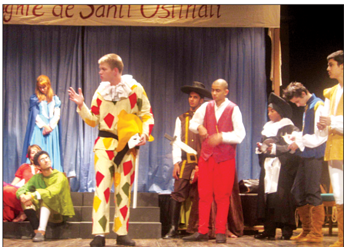
Students of American International School, Dhaka in the play