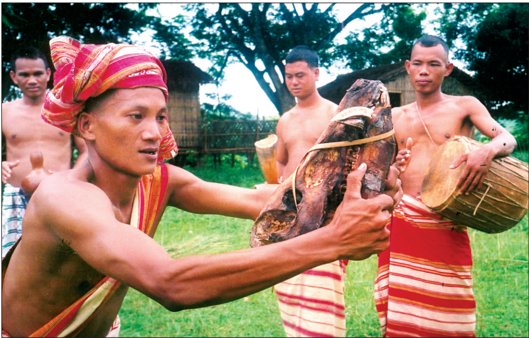
'Hunting Dance' by Pangkhu performers (Top) and 'Cow Slaughter Dance' of the Mru

Organiser: The High Commission of India in Dhaka November 13 6:00pm Bemisal November 14 6:00pm Golmaal Venue: Indian Cultural Centre, House 25, Road 96, Gulshan-2 Complementary passes can be collected from the High Commission of India, House 2 Road 142 Gulshan 1 & the Indian Cultural Centre House 25 Road 96, Gulshan 2