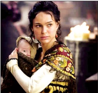
Natalie Portman in a scene from the film

Fans of double Oscar-winner Milos Forman might be expecting his first film for seven years, Goya's Ghosts , to provide an examination of revolutionary Spanish painter, Francisco