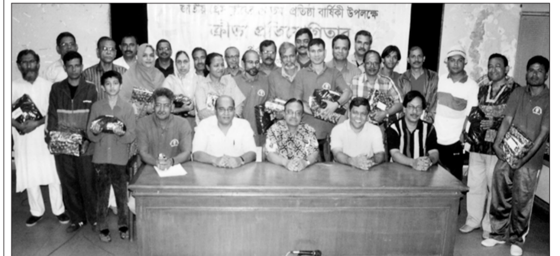
Winners of the Jatiya Press Club mini marathon pose for photograph after the prize distribution ceremony at the JPC VIP Lounge yesterday.

I am not a doctor and don't know much about medicines."