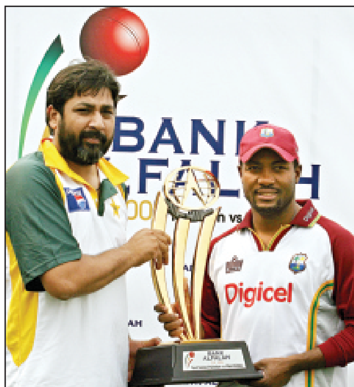
West Indies captain Brian Lara (R) and Pakistan counterpart Inzamamul Haq hold up the trophy of their upcoming Test series during a ceremony in Lahore on Friday.

tions by the Indian officer have put pressure on us. But we have the calibre to come back and perform well," he said.