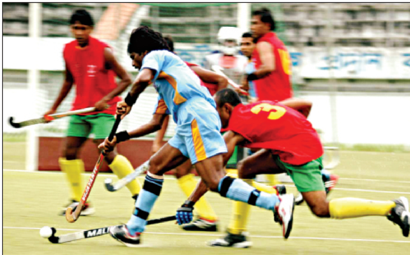
Abahani and former Indian star Dhanraj Pillay races past the Sonali Bank defenders during their Super Five match of the Premier Hockey League at the Maulana Bhasani National Hockey Stadium yesterday.