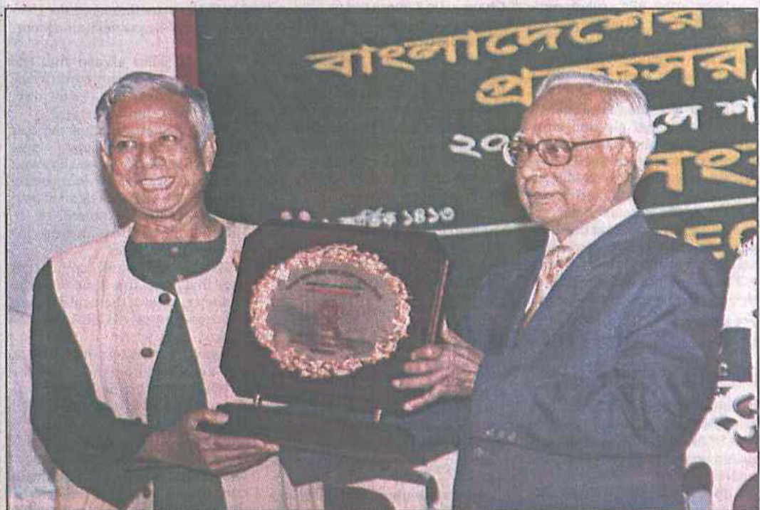
President and Chief Adviser Iajuddin Ahmed hands over a crest to Prof Muhammad Yunus at a reception accorded last night in honour of the microcredit guru who won this year's Nobel Peace Prize.