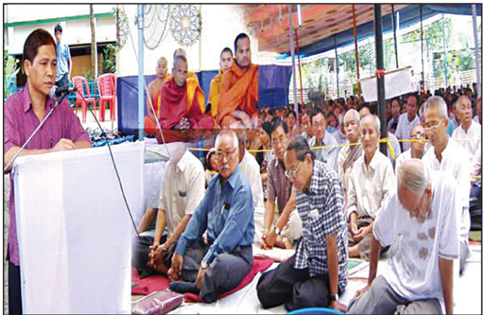
Buddhist devotees gather at the festival

Hundreds of Buddhist devotees thronged the compound of Ananda Vihar on the occasion.