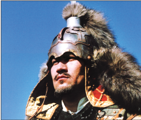
Genghis Khan On Discovery Channel at 8:30pm The great Khan's indomitable spirit, brutality and unquenchable desire for conquest