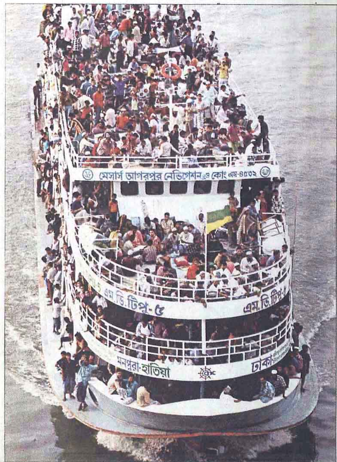
A launch leaves Dhaka yesterday with passengers occupying every bit of floor-space on the vessel ahead of the Eid holiday. Despite mobile courts' warnings of stern actions against such overloading, vessels carry on their malpractice.