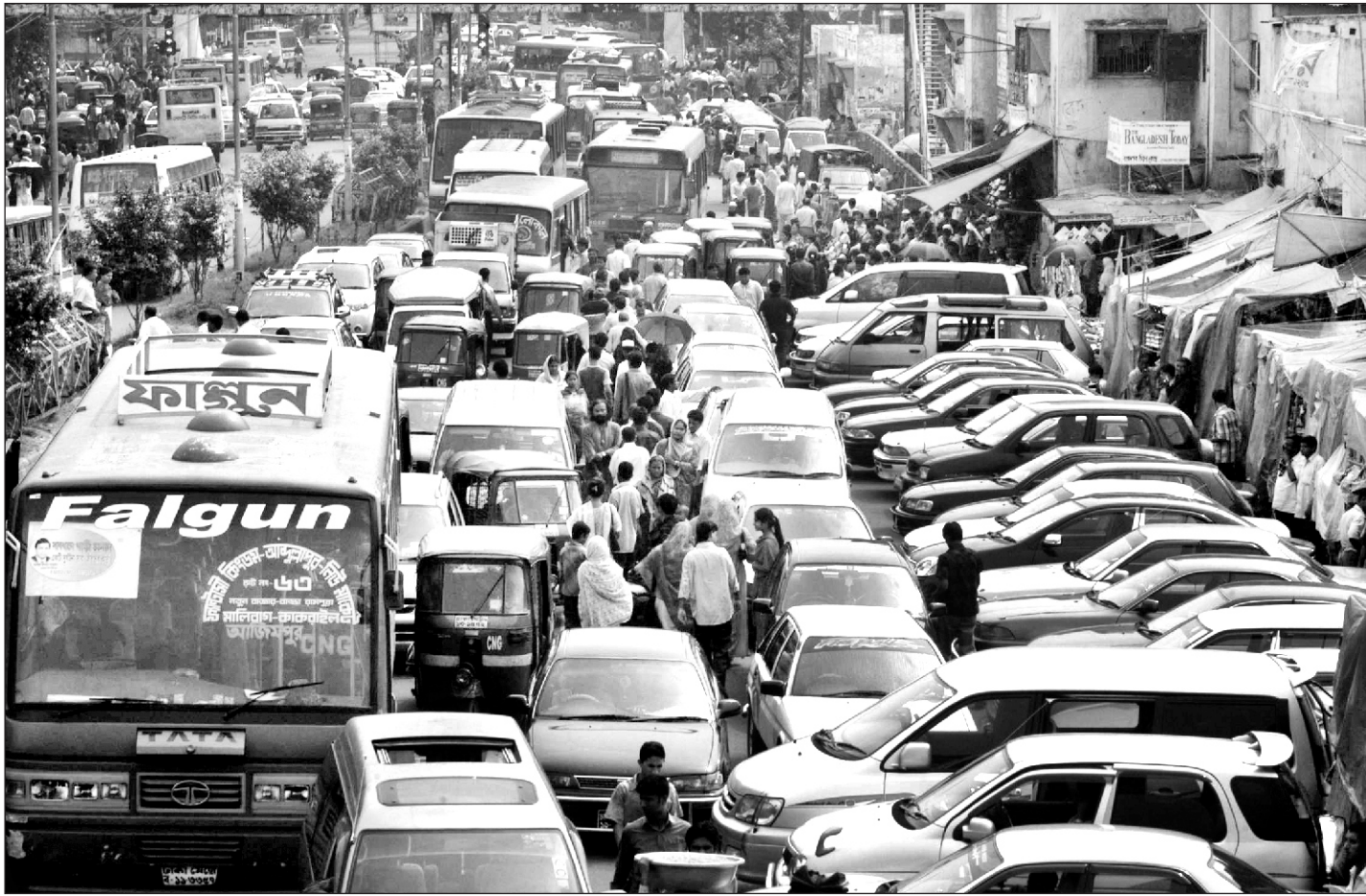
Haphazard car parking in front of the New Market adds to traffic congestion on Mirpur Road in the city. The picture was taken yesterday.