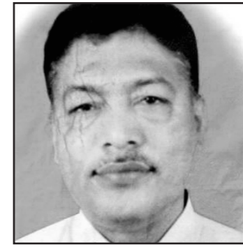
Dr Shahidul Alam

Being aware of the widening rift, Prime Minister Khaleda Zia during her October 5 visit to the Kaliganj she did not announce any alliance candidate from the constituency.