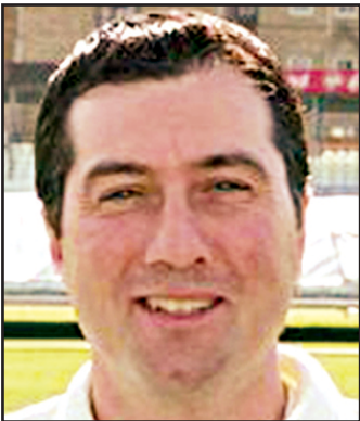
Ronnie Irani (Ex-England cricketer) "There's no 'I' in team but there's an 'I' in winners."