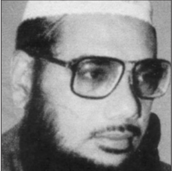
Mufti Fazlul Haque Amini