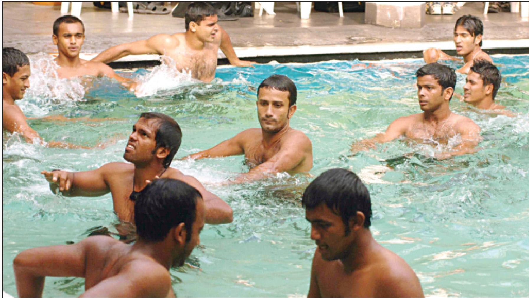
Bangladesh players enjoying their time in the swimming pool of Sonargaon Hotel yesterday.