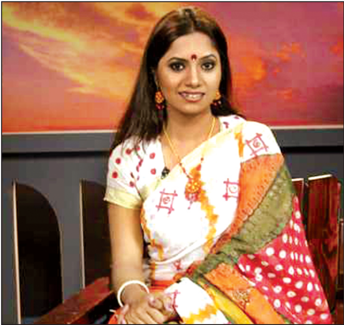
A scene from the TV show