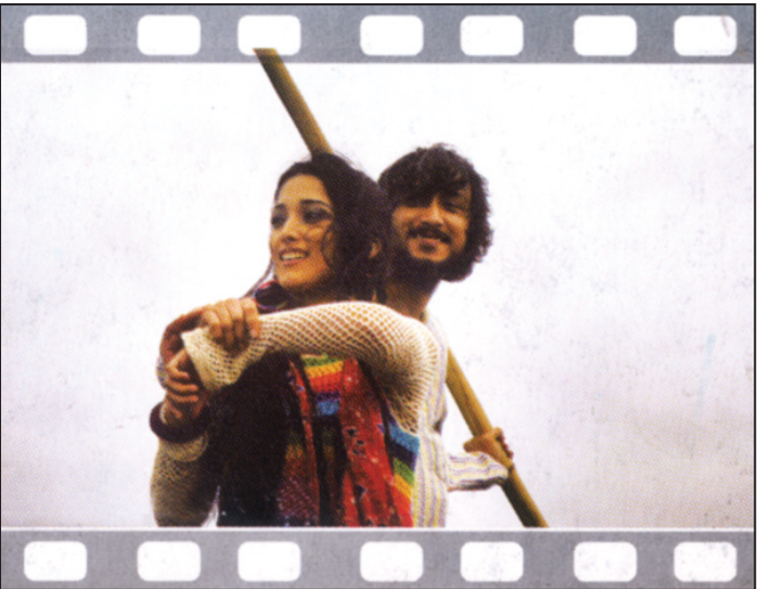
Scenes from the film