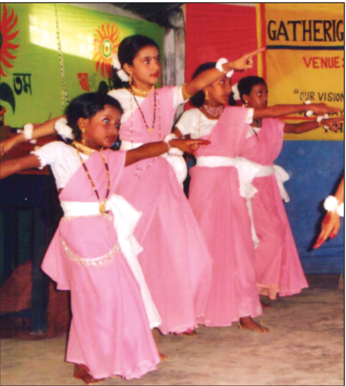
Children perform at a cultural programme organised by World Vision at Phulbari, Mymensingh recently. The programme was a part of a gathering of child forum members