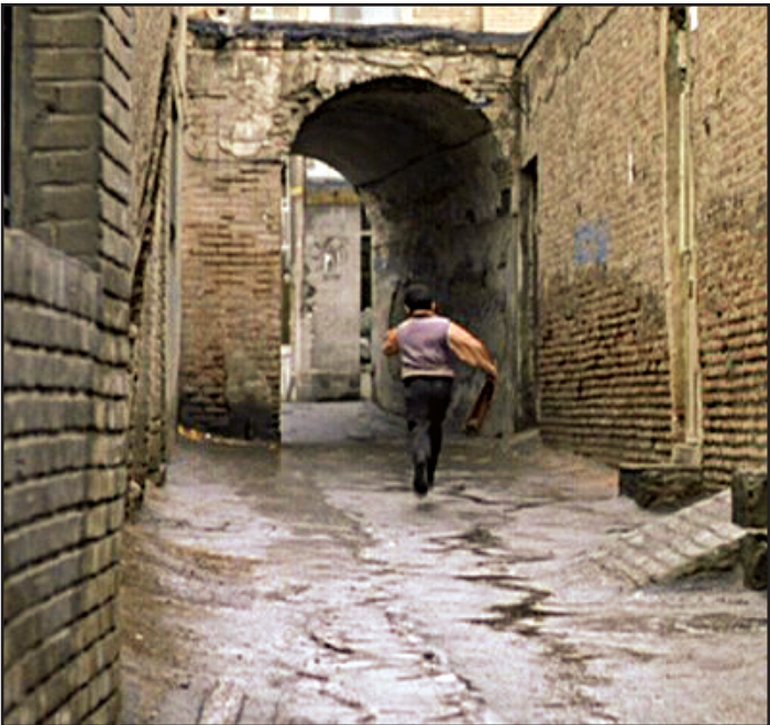
Clippings from Children of Heaven (above) and The Kid (below) screened in the festival