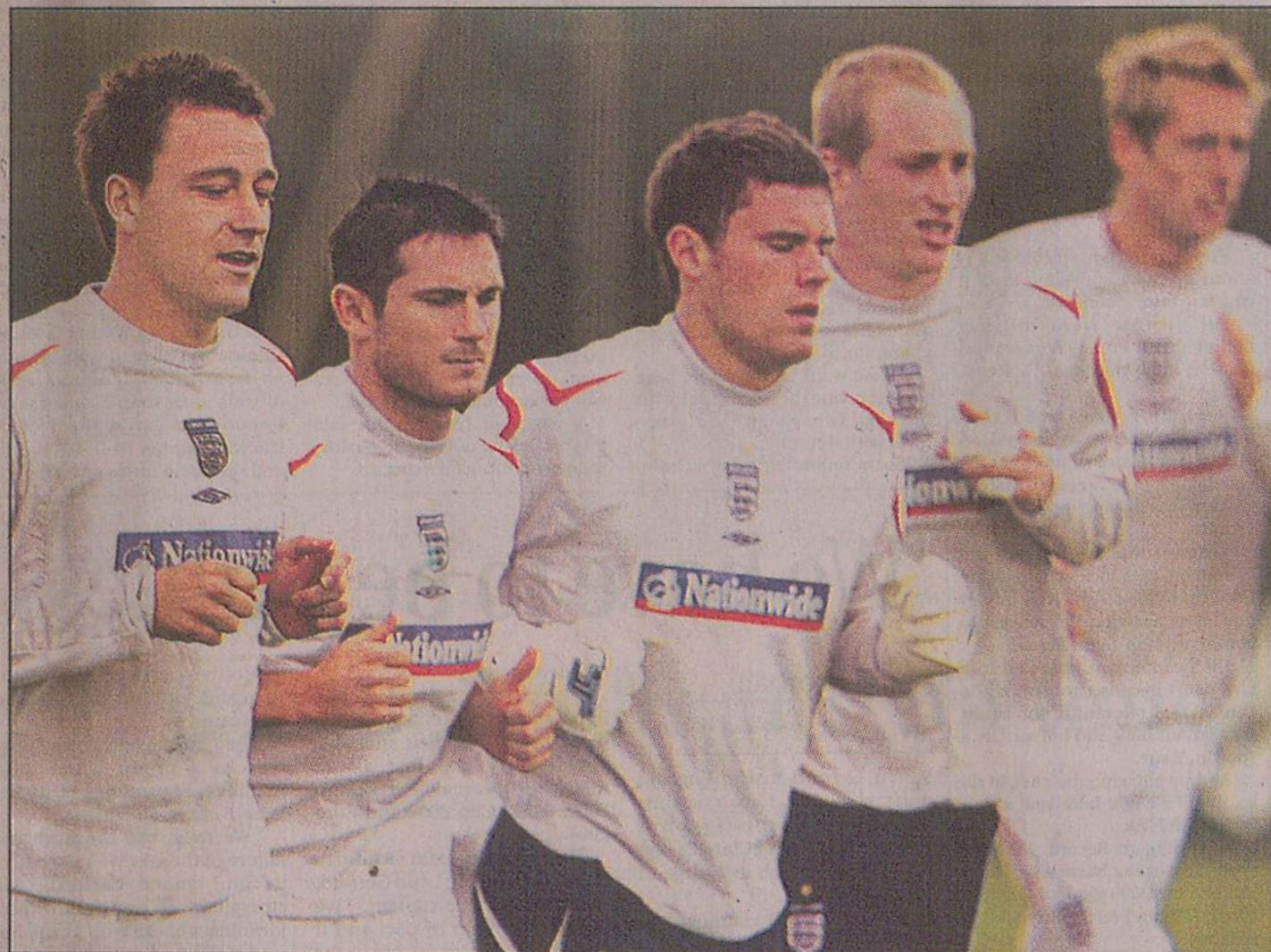
England captain John Terry (L) leads his players as they take part in a training session at Carrington, Manchester on Wednesday.