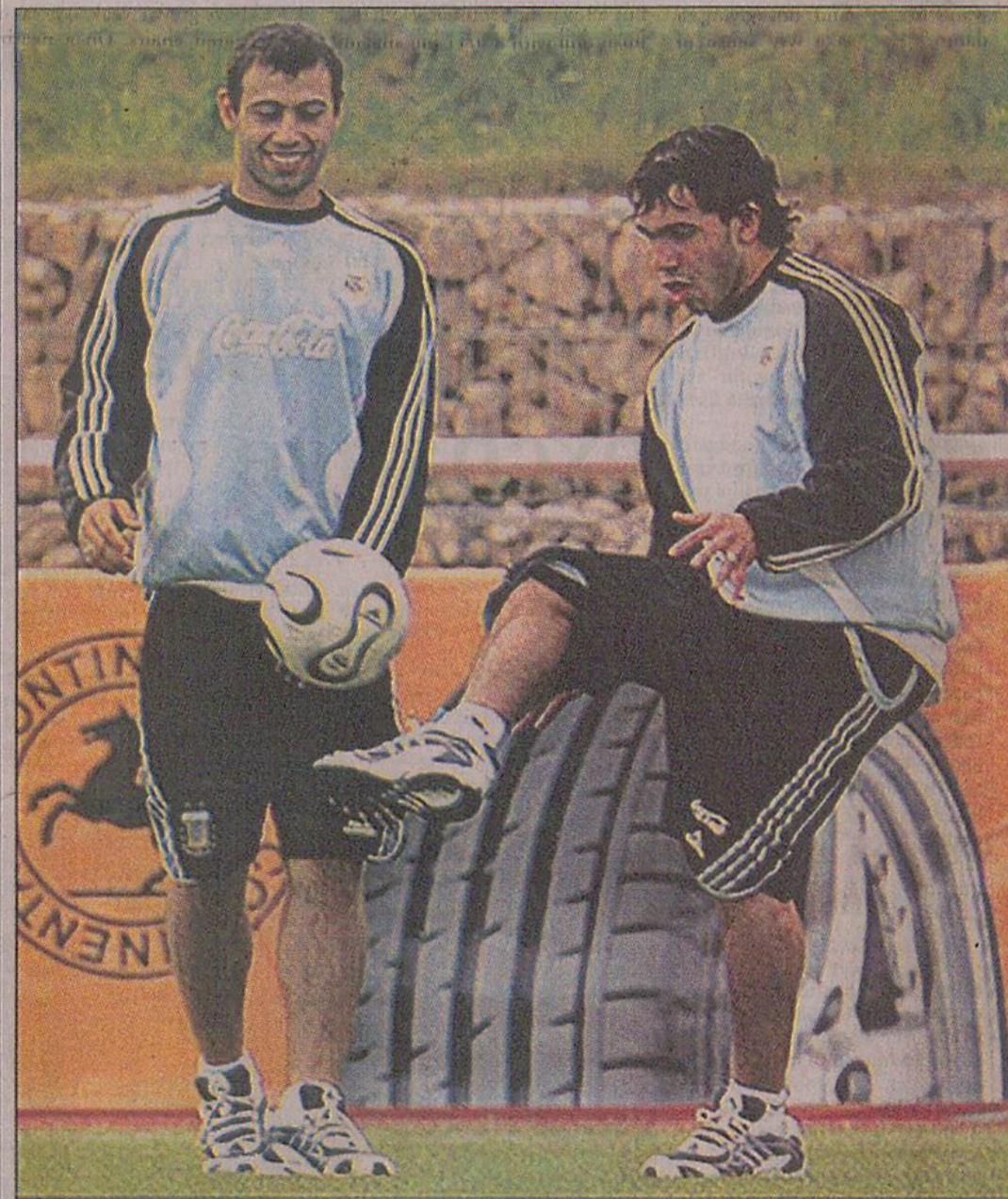
Argentina forward Carlos Tevez (R) controls the ball as teammate Javier Mascherano watches during a training session at the World Cup in Germany in June 2006.