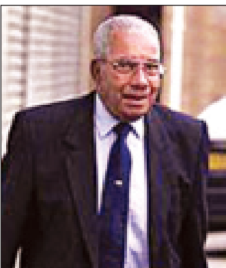
SIR CLYDE LEOPOLD WALCOTT

1945-46 when, just 20 years old, he added an unbroken 574 for the fourth wicket with his schoolmate, Worrell, for Barbados against Trinidad at Port of Spain.