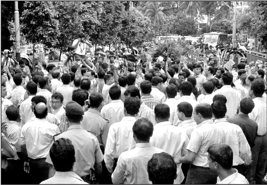
Police prevent members of BCS General Education Association from staging a sit-in in front of Shikkha Bhaban in the city yesterday.