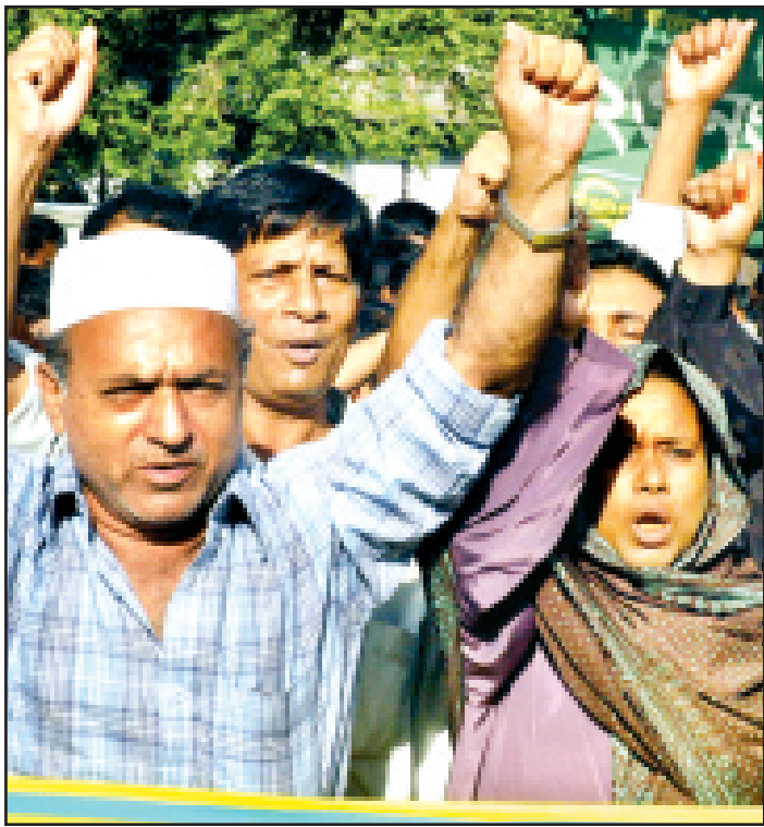
Bangladesh Shikshak Karmachari Samannoy Parishad stages a demonstration at Muktangan in the city yesterday protesting declaration of conditional salary rise.