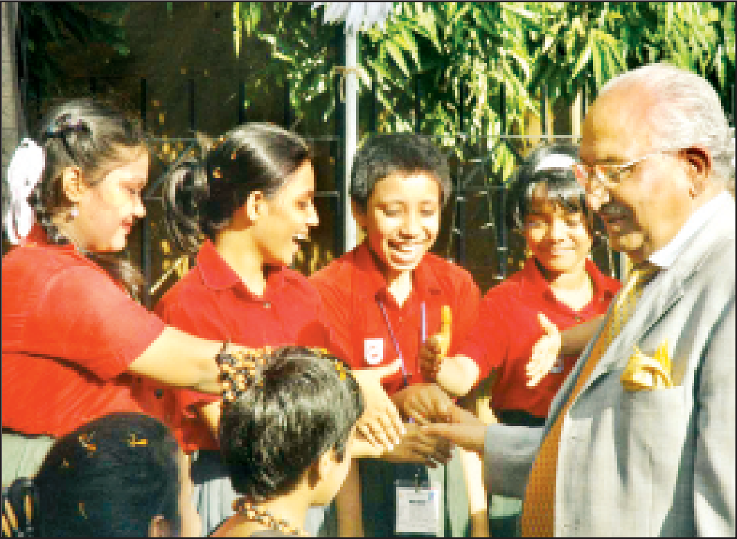
Cheerful children shake hands with Finance and Planning Minister M Saifur Rahman at the Shishu Academy Literary Award giving ceremony on Shishu Academy premises in the city yesterday.

In case of unfavourable weather condition, the meeting will take place at the Teacher-Student Centre (TSC) auditorium.