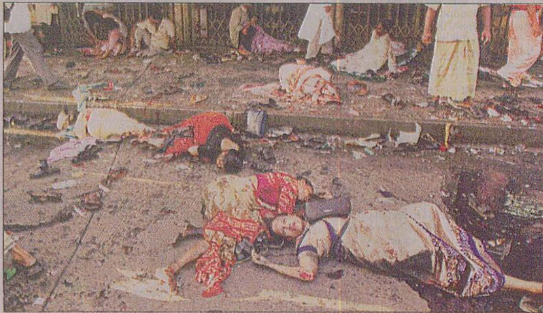
Perpetrators and masterminds of a massacre of this magnitude on August 21, 2004 still remain out of police dragnet. This photo was taken immediately after the grenade attack on Bangabandhu Avenue in the city.