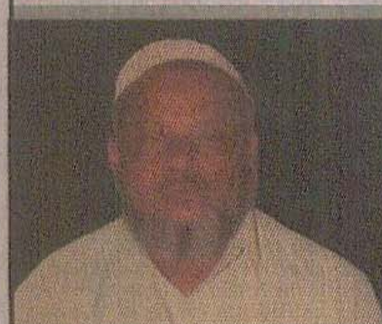
Former Chairman EPYLLION Group