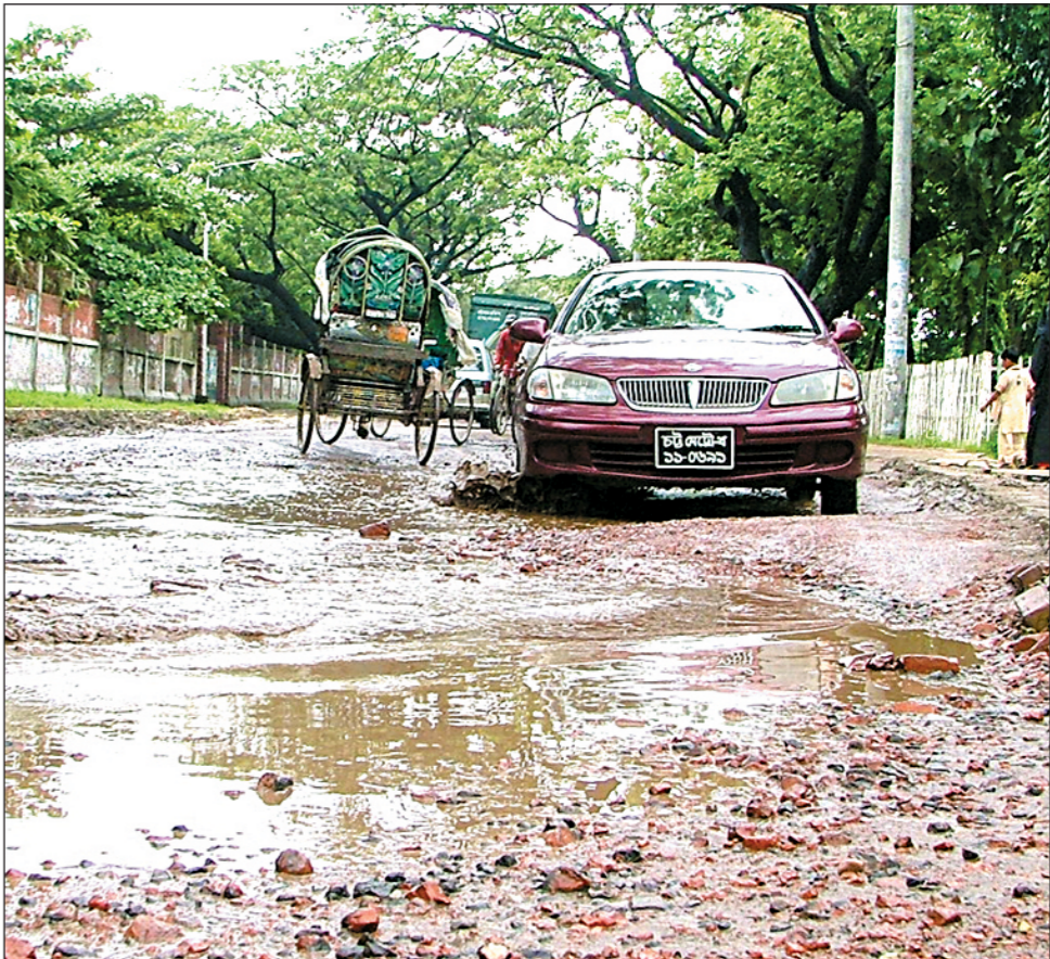
Following the downpours of the monsoon, most of the city roads are now in a miserable condition making movement of both the vehicles and the pedestrians difficult. The road in front of Chittagong Port Hospital bears a testimony to plight of the city dwellers.