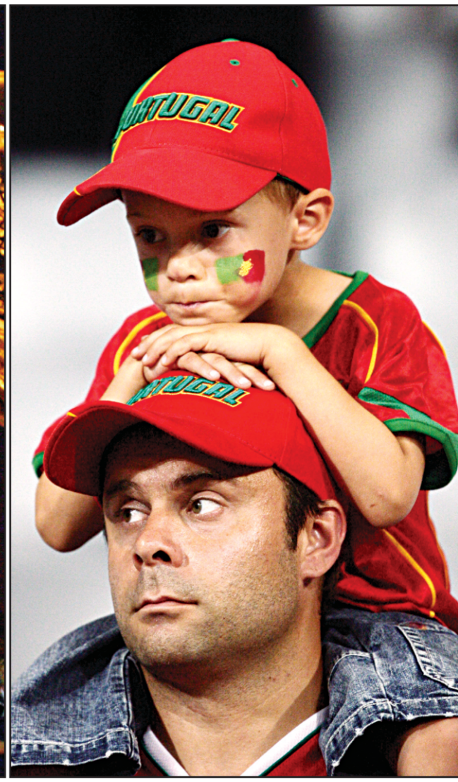
DELIGHT AND DESPAIR: French fans (L) celebrate their country's victory over Portugal at the Eiffel Tower in Paris while a Portuguese supporter, with his son sitting on his shoulders, looks dejected after his side's demise at Munich on Wednesday.