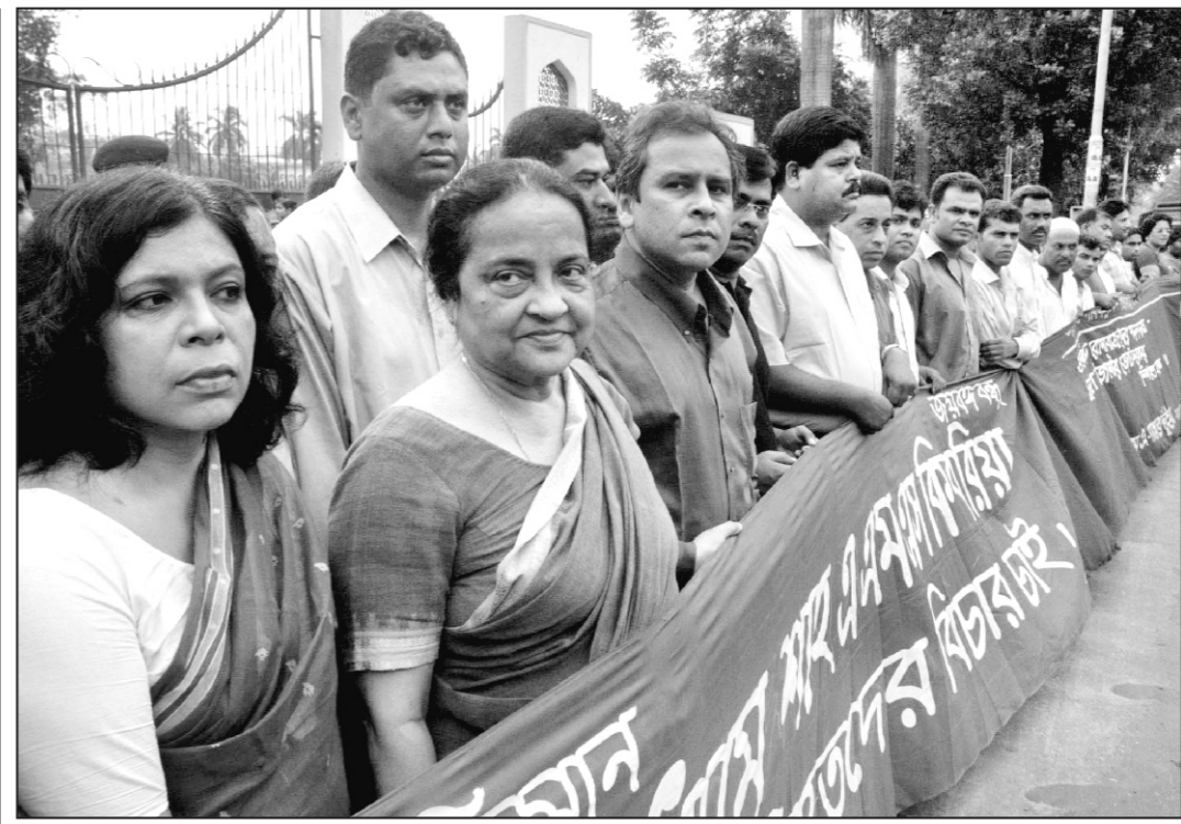
Family members of slain former finance minister Shah AMS Kibria and civil society members line up in front of the High Court in the city yesterday as part of Blue for Peace programme demanding fair trial of the Kibria murder case.

"Today, there is an obvious challenge for the majority of Muslims and it is simply to reclaim Islam from the extremists. It is to turn this destructive resurgence into a renaissance - that enhances the lives of Muslims and enriches the wider human existence," he said.