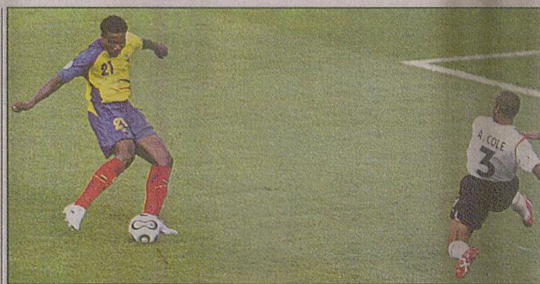
Ecuadorian forward Carlos Tenorio, left, tries to shoot at the England net as English defender Ashley Cole slides in to block the shot during their World Cup football match at Stuttgart yesterday. England won the match 1-0.