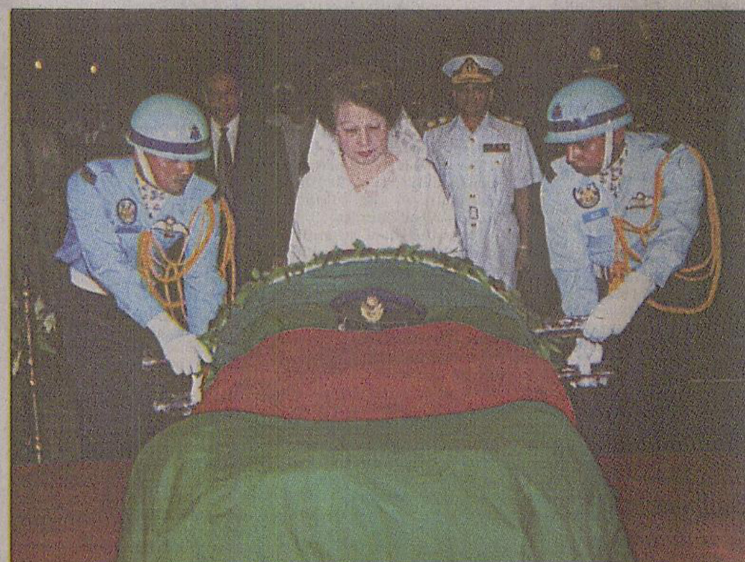
Prime Minister Khaleda Zia places a wreath on the coffin containing the remains of Birsreshtho Matiur Rahman at the Zia International Airport last night.