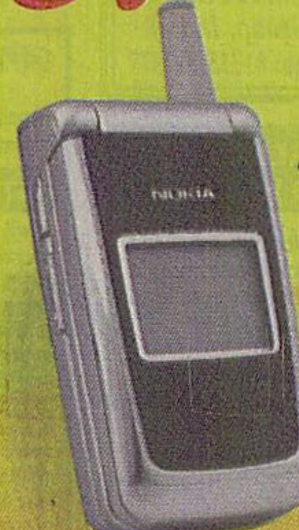
Dual/Color Display MP3 Ringtone Internet Personalized Theme

Nokia 2255 | Tk. 6399 (Connection + Handset)