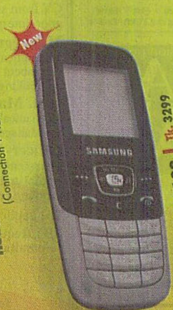
Large Phone Book Four Digit Dial Polyphonic Ringtone

Huawei C506 | Tk. 3099 (Connection + Handset)