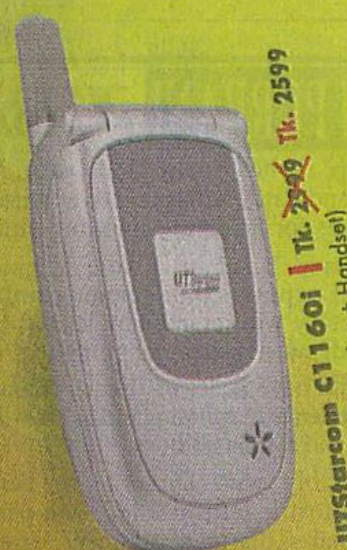
Flip Style Polyphonic Ringtone

UTStarcom C11601 | Tk. 2599 (Connection + Handset)