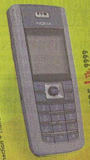
Video/Camera Color Display MP3 Ringtone Internet

Nokia 3155 | Tk. 8999 (Connection + Handset)