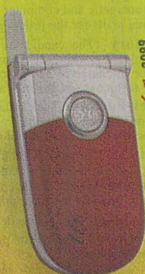
Color Display Polyphonic Ringtone Games

UTStarcom C11601 | Tk. 2599 (Connection + Handset)