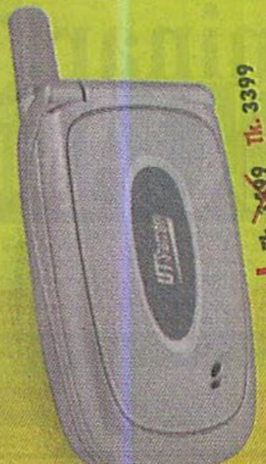
Flip Style Color Display Polyphonic Ringtone

Samsung SCH-S109 | Tk. 3299 (Connection + Handset)