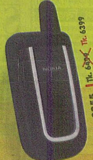
Color Display Radio Flashlight Polyphonic Ringtone

UTStarcom C1161 | Tk. 3399 (Connection + Handset)