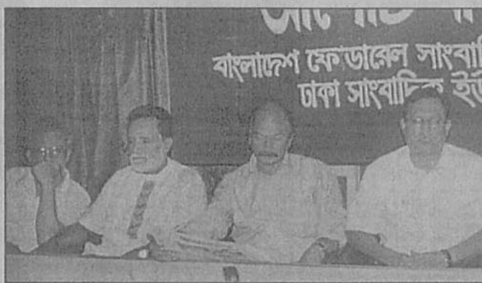
Dhaka Union of Journalists (DUJ) and Bangladesh Federal Union of Journalists (BFUJ) organised a discussion at the National Press Club in the city yesterday to mark the 'Journalist Repression Day'.

The speakers observed that the incidents of repression against journalists have increased during the rule of the four-party alliance government.