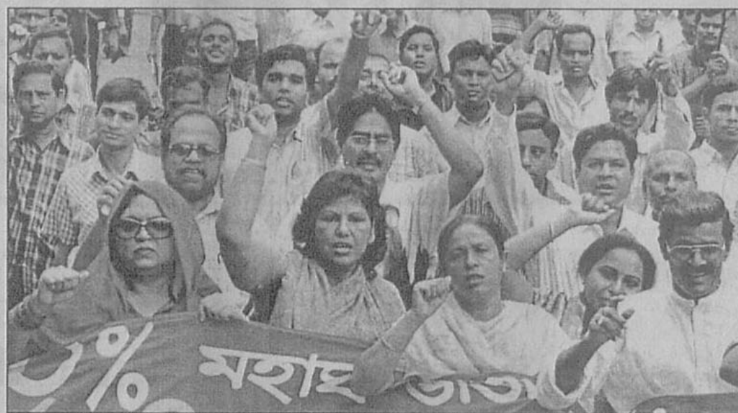
Bangladesh Sarkari Karmachari Dabi Bastobayan Parishad takes out a protest procession from AG office at Segunbagicha in the city yesterday demanding 50 percent dearness allowance.