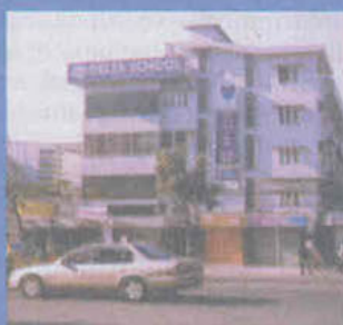
PG to Std VIII Branch

Unique Trade Centre (UTC), Level 13 & 15, 8 - Panthapath, Dhaka - 1215. Phone : 914 5566.