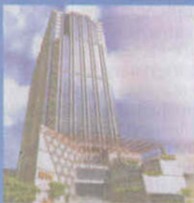
O/A Level Branch

Unique Trade Centre (UTC), Level 13 & 15, 8 - Panthapath, Dhaka - 1215. Phone : 914 5566.