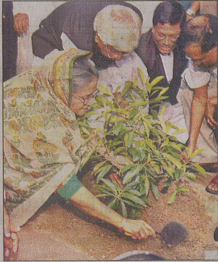
Awami League President Sheikh Hasina inaugurates a three-month tree plantation campaign of Bangladesh Krishak League by planting a sapling at the green lawn adjacent to Bangabandhu Memorial Museum yesterday.