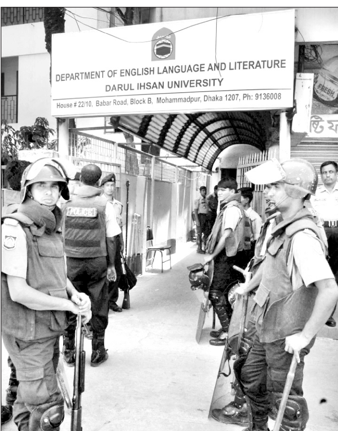
Police guarded university campus on May 17.