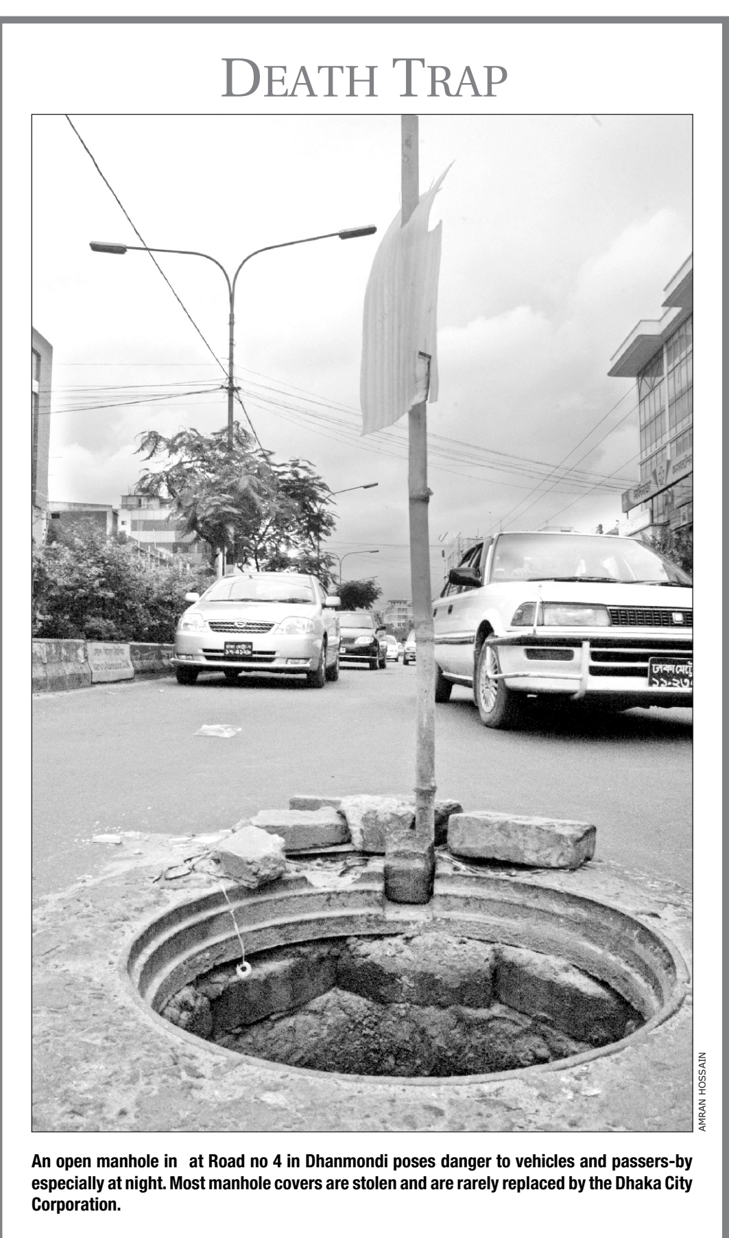
An open manhole in at Road no 4 in Dhanmondi poses danger to vehicles and passers-by especially at night. Most manhole covers are stolen and are rarely replaced by the Dhaka City Corporation.