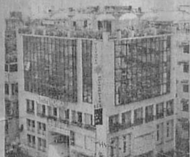
Dhaka Study Centre (DSC)

Victoria University, Australia, Dhaka Study Centre