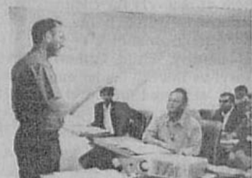
Melbourne Faculty Taking Class

Faculty from Melbourne campus for each and every course at Dhaka Study Centre