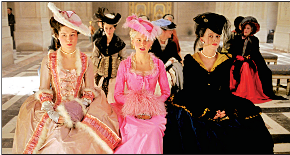
Kirsten Dunst (C) with co-actors in the film

Marie Antoinette is competing for the Palme d'Or, the top honor at Cannes, a prize the director's father, Francis Ford Coppola, won in 1979 with Apocalypse Now . A win for Marie Antoinette Sunday would mark the first time in the festival's 59 years that a child of a past recipient won the Palme d'Or.