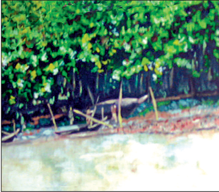
Paintings of Sundarbans by Ahmed Nazir

The people in the Sundarbans are mostly fishermen and in one of the acrylics we see them caught in a storm when the sky turned red. In another picture we get the waters and the sky in the morning with a touch of mist. The artist, in his quest for catching the different images of nature depicted a morning scene. After the rains, without the bright sunshine, there was still light aplenty to see the different hues of