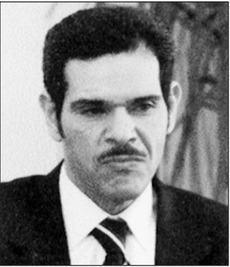
SHEIKH SALMAN AL SABAH

President of Asian Shooting Confederation (ASC) Sheikh Salman Al Sabah will arrive in the capital today. During the visit the ASC chief, a member of the Kuwaiti royal family, will meet the executive members of the Bangladesh Shooting Federation at Gulshan today.