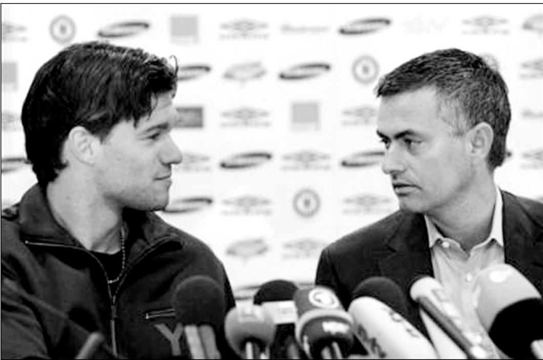
Chelsea manager Jose Mourinho (R) speaks with newly-recruited German midfielder Michael Ballack at Stamford Bridge in London on Monday.

Tens of thousands of jubilant fans jammed the streets of Liverpool for the second time in 12 months to welcome home their triumphant football team on Sunday. Just a day after claiming the FA Cup after a thrilling final against West Ham in Cardiff, which Liverpool won on penalties after a 3-3 draw, the players took off for a 10-mile tour of the city in an open-topped bus. Dressed all in matching club tracksuits, the Liverpool team set off in the bus flanked by mounted policemen while children ran alongside their heroes. It was only a year ago that Liverpool brought home the European Cup, for the fifth time, after an equally thrilling final, also won on penalties after a 3-3 draw. Although there were fewer supporters there to see the team than had been the case when an estimated 750,000 turned out when the Reds brought home the Champions League trophy last May, that did not seem to affect the atmosphere. Children were lifted onto their parents' shoulders as the crowds grew thicker with others perched on top of bus shelters, lamp-posts and street signs. Man of the match Steven Gerrard, who is due to fly out to England's World Cup training camp in Portugal on Monday and scored the crucial last minute equaliser on Saturday to send the game into extra-time, was one of the calmest figures on the top deck, preferring to stay seated unlike many of the other players.