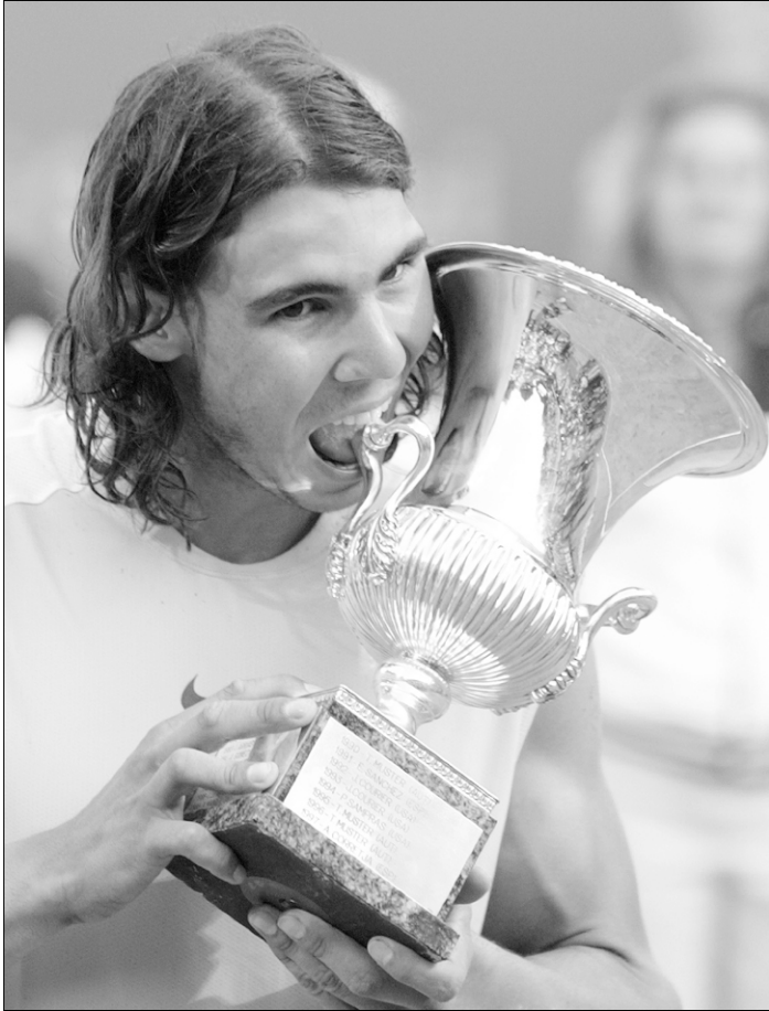
Spanish teenage sensation Rafael Nadal bites the Rome Masters trophy after defeating Roger Federer of Switzerland in the final on Sunday.

Having blazed around against the likes of Andrew Flintoff, Mahendra Singh Dhoni says he is not alarmed by the West Indian fast bowlers eager to breathe fire at the Indian batsmen in the forthcoming series. "As a cricketer you are always looking to improve but it does not mean there are any undue concerns about their fast bowlers and their pace," said Dhoni after the nets. "I faced Andrew Flintoff at home and he was bowling genuinely quick with bounce. So there is no alarm as such about the West Indian fast bowlers." The dashing Indian wicketkeeper-batsman, however, was quick to add that he was ready to adjust himself against the hosts attack, if required. "If I have to do adjustments, I would do so at the necessary time," he said. Dhoni revealed that he had come expecting slow pitches and his impression seemed to be right if the venue for the nets was any indication. "I have come over expecting wickets to be slow yet providing grip to the spinners. This one in the middle certainly confirms the impression," he said about the strip at Chadwin Park where the team practised Sunday morning.