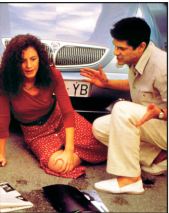
A scene from Kilometer Zero