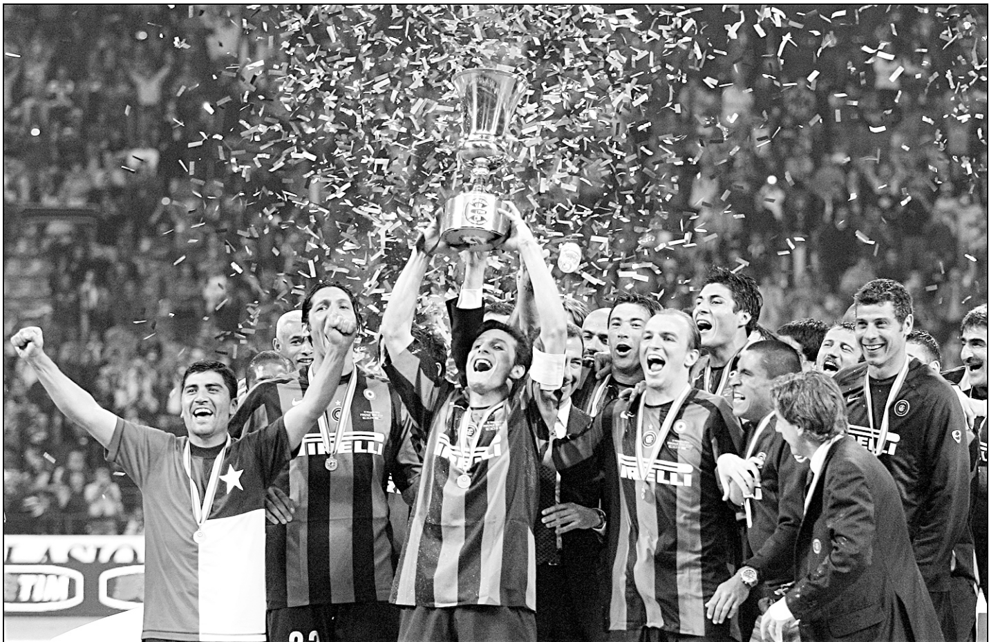
Inter Milan players celebrate after winning the Coppa Italia by beating AS Roma in the two-legged final at the San Siro Stadium in Milan on Thursday.