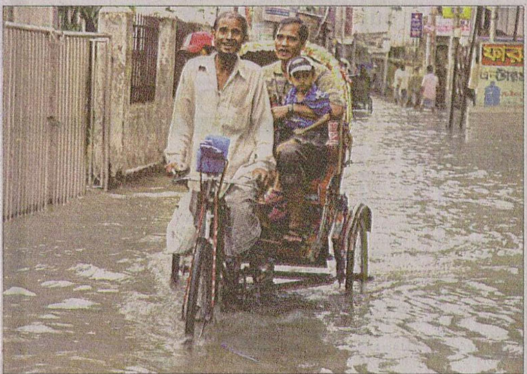
A rickshaw with passengers wades through knee-deep water on a Nayatola road in the city's Maghbazar area after yesterday's heavy shower.