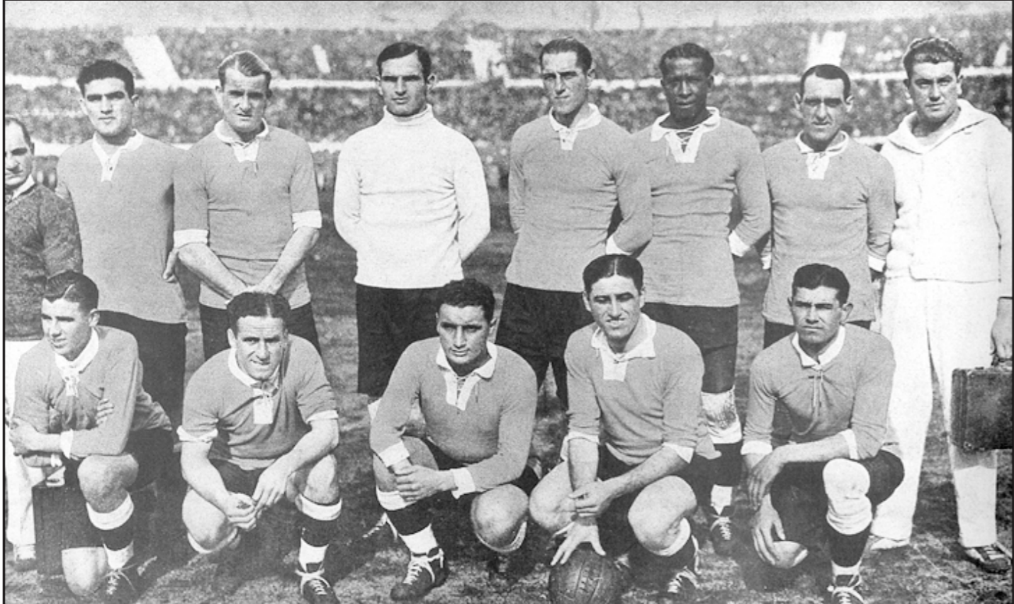
Uruguay of 1930, the first world champions of football.