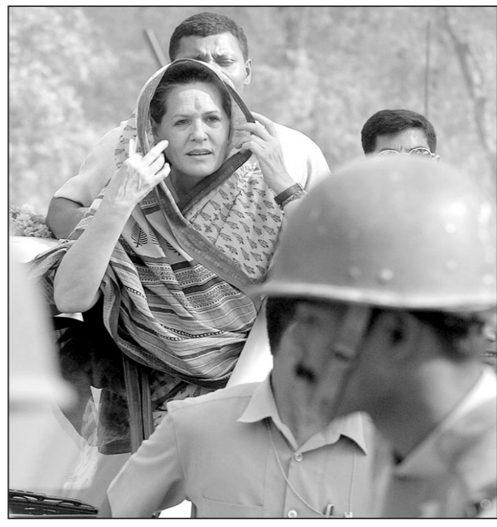
President of India's ruling Congress Party and Chairperson of the United Progressive Alliance (UPA) Government Sonia Gandhi drives through a village as part of her election campaign for a by-polls scheduled to take place in Uttar Pradesh's Rae Bareilly constituency on May 8.

AFP, Khar Armed men stormed a Pakistani security post in a remote tribal region near the Afghan border and killed three policemen, officials said yesterday. The attack happened shortly before midnight on Wednesday at Kotki Charmang post in the Bajaur tribal district, a local security official in the region's main town Khar told AFP. "Three levies (tribal police) died in the attack and we are investigating who the attackers were," the official said, requesting anonymity. Bajaur, which borders Afghanistan's insurgency-plagued eastern province of Kunar, was the scene of a controversial US air strike aimed at al-Qaeda number two Ayman al-Zawahiri in January. Zawahiri, Osama bin Laden's lieutenant, was due at a house in the village on the day of the air strike but did not show up.