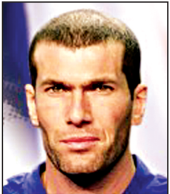
Zinedine Zidane (French football superstar)

"I didn't want to go on for another year. The past two years I haven't been on top form and that's no good when you play at a club like Real." While explaining his decision to retire after the World Cup finals.