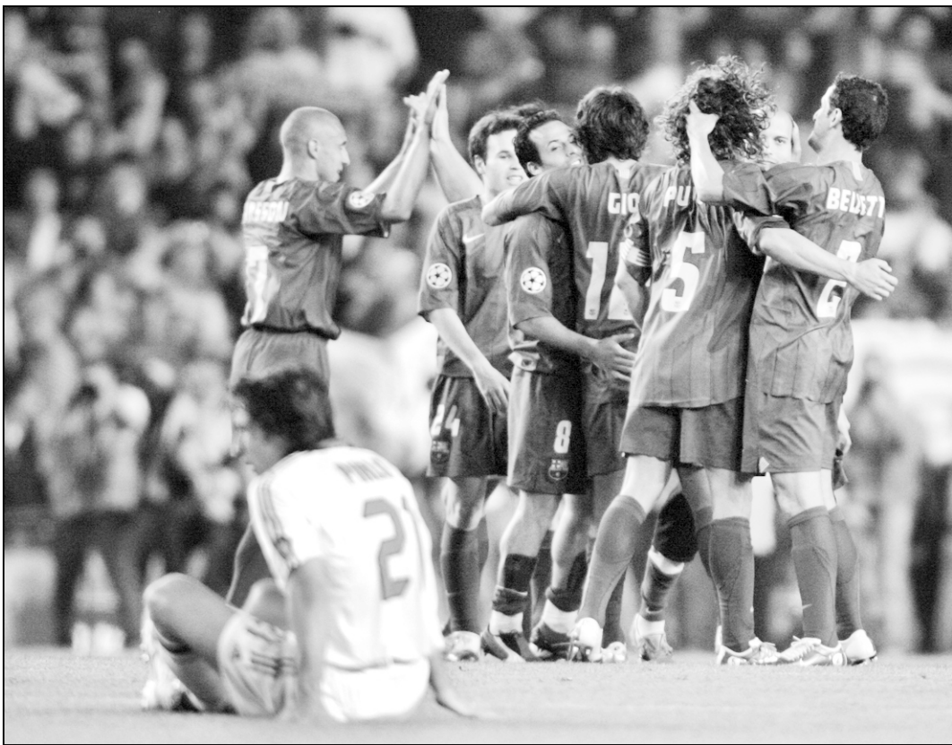
Barcelona players celebrate as AC Milan's Andrea Pirlo sits dejected on the ground after drawing their Champions League semifinal second leg match at the Nou Camp on Wednesday.

"I didn't want to go on for another year. The past two years I haven't been on top form and that's no good when you play at a club like Real." While explaining his decision to retire after the World Cup finals.