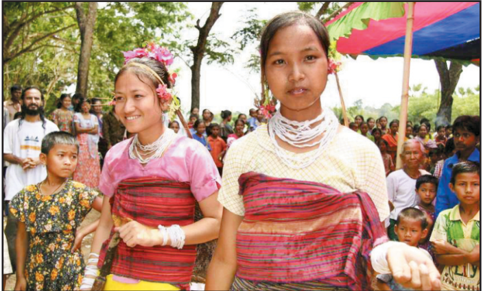
Indigenous girls dressed in traditional attire

The festival was inaugurated amidst much enthusiasm at the Thaingkyong Buddhist Monastery. Thousands of adults and children of the indigenous community attended the event.