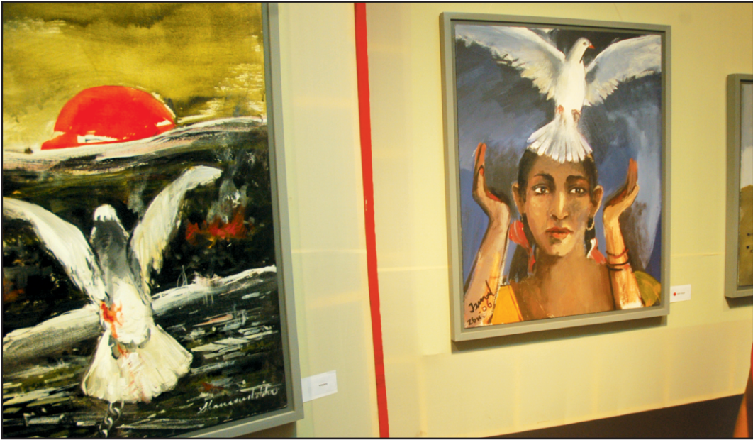
Some of the artistic works on display

Colourful canvases, portraying the figures of the front line freedom fighters, embody the spirit of