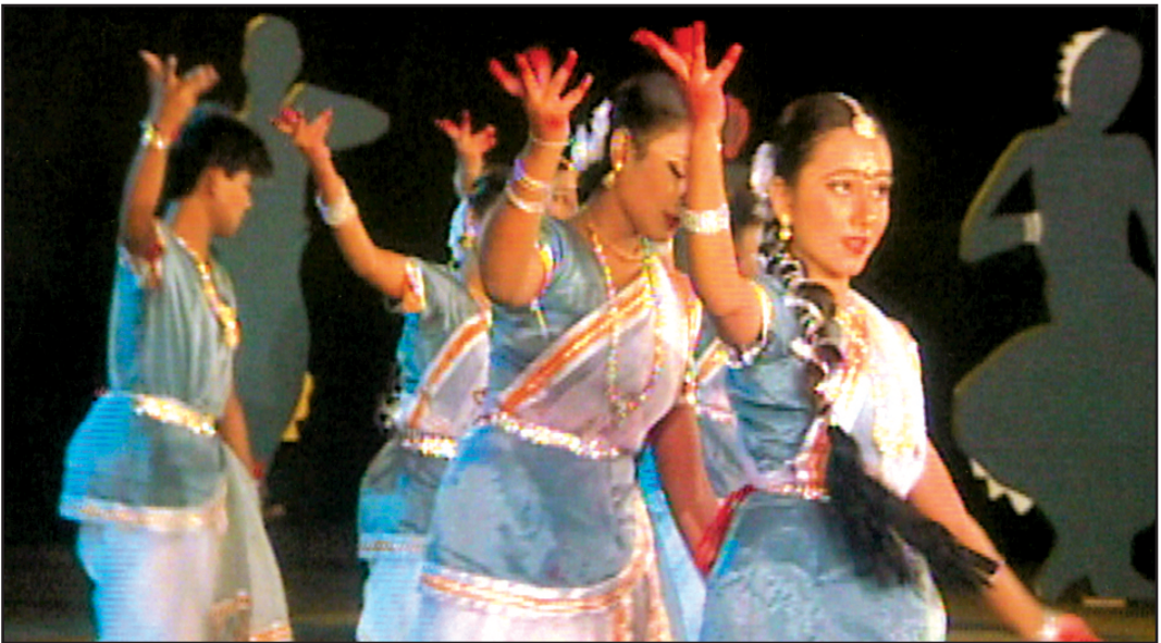
Young artistes stage a performance in Nupur