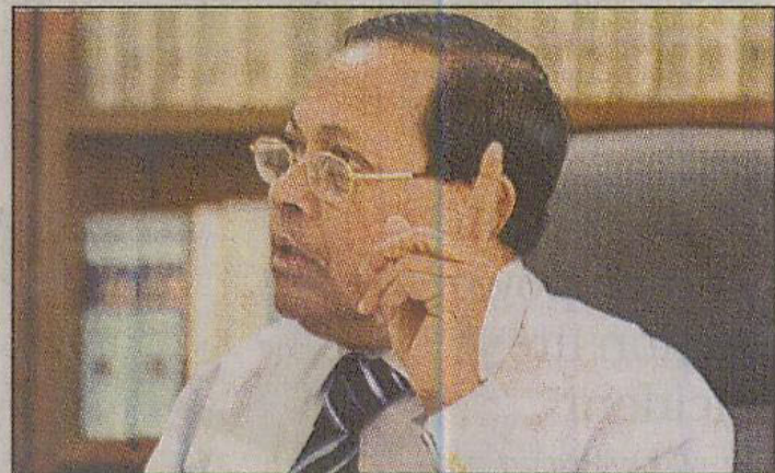
Law Minister Moudud Ahmed