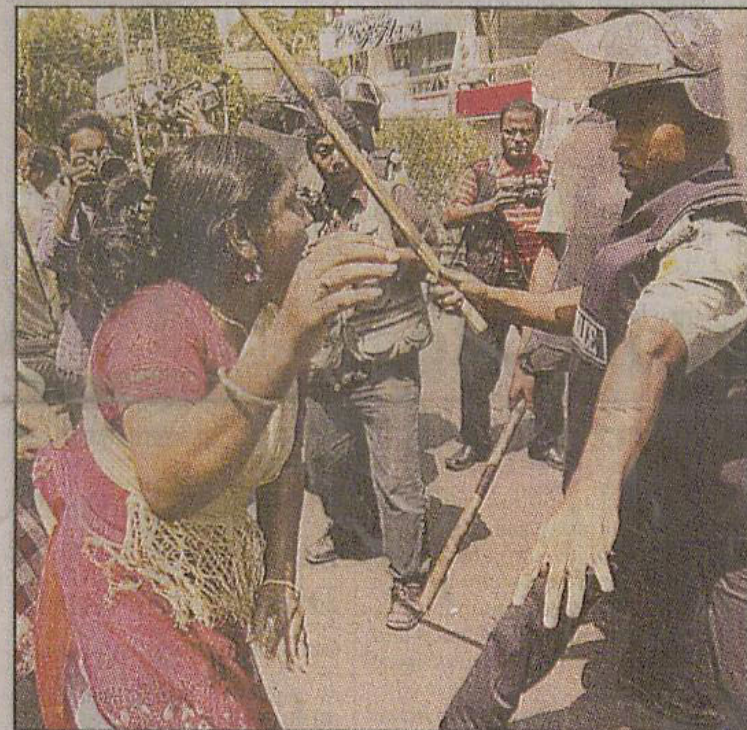
A policeman, left, clubs a Jubo Mahila League activist in front of photojournalists on Dhanmondi Road-27 in the capital during the opposition-called hartal yesterday. Another policeman grabs the scarf of a Jubo Mahila League activist and she tries to snatch his shotgun.