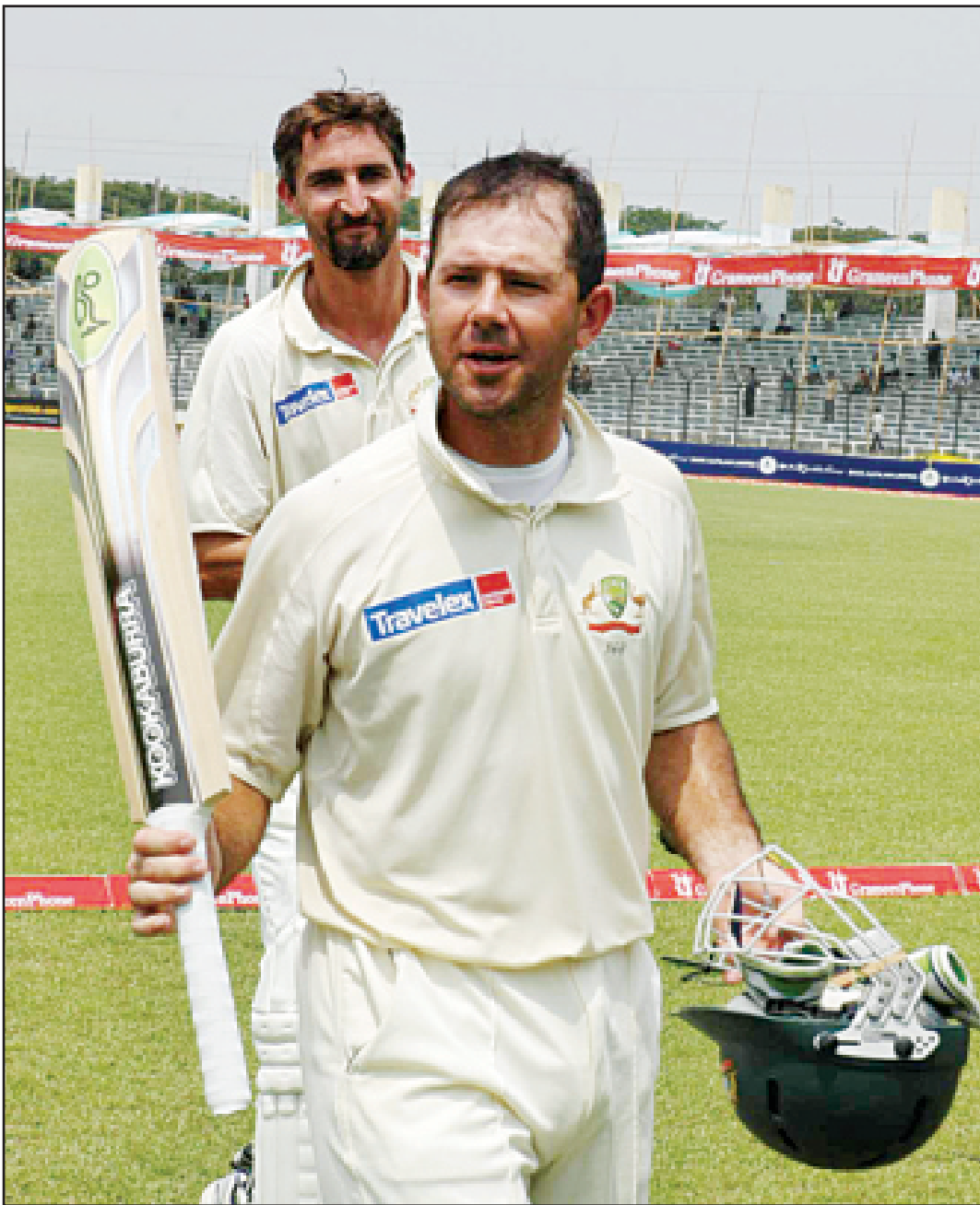
PHOTO: STAR Australian captain and match-winner Ricky Ponting acknowledges the crowd after Australia completed a victory over Bangladesh on the fifth day of the first Test at Fatullah on Thursday.

DD National India v England Seventh and final ODI Live at 9:30 am (Saturday) ESPN Manchester United v Sunderland English Premiership Live at 12:30 am (Saturday) STAR Sports Bolton Wanderers v Chelsea English Premiership Live at 5:40 pm (Saturday) STAR Sports Arsenal v West Bromwich English Premiership Live at 7:55 pm (Saturday)