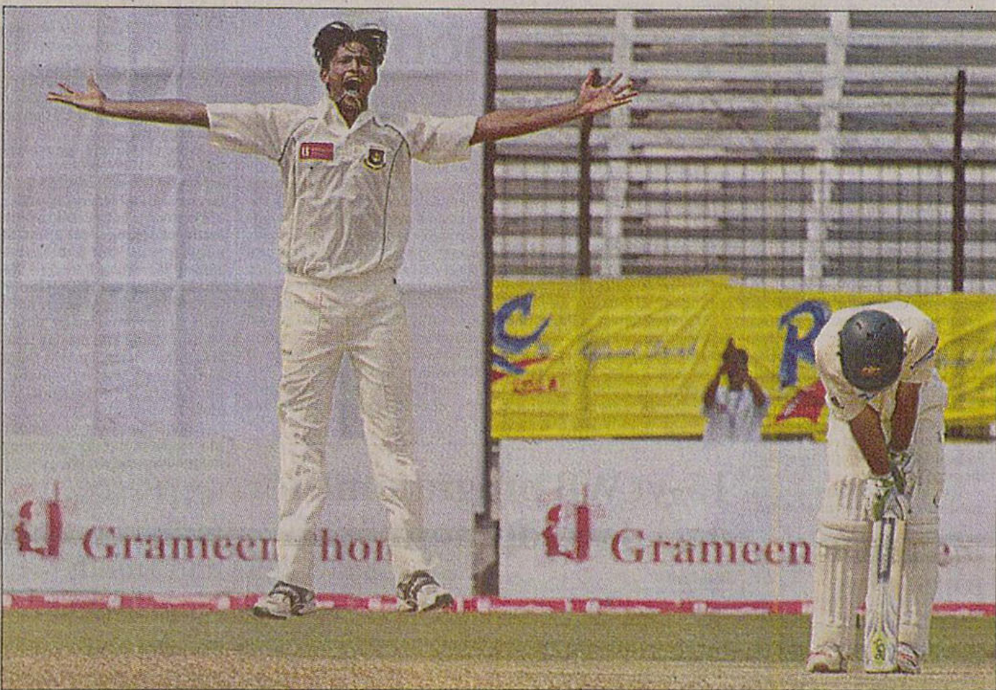
Tearaway Shahadat Hossain exults after having Australia skipper Ricky Ponting plumb in front.