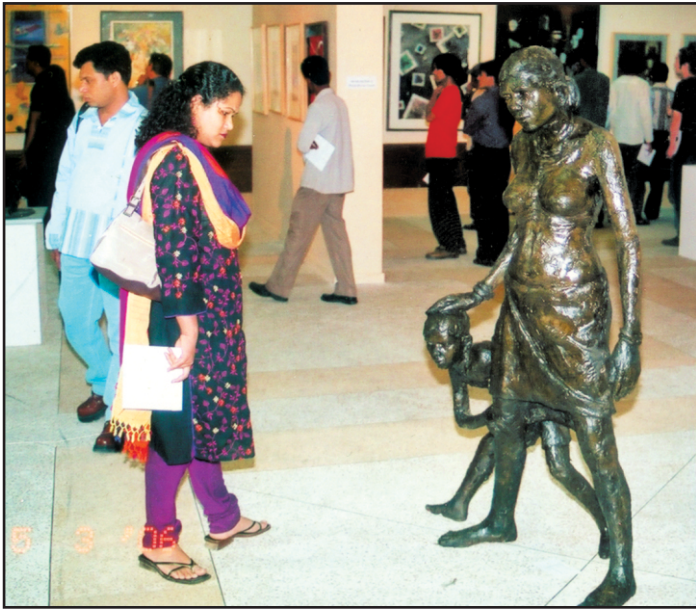
A viewer closely observes a life-size sculpture at the exhibition