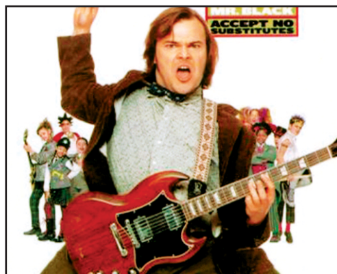
The School of Rock On HBO at 09:30 pm Genre: Comedy Cast: Jack Black, Joan Cusack

All programmes are in local time. The Daily Star will not be responsible for any change in the programme.