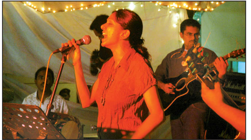
A scene from Kisher Badya Baj Go , performed by Amader Theatre marking a week-long street drama festival recently at the local Town Hall premises in Mymensingh.

Fashion house Aarong recently held musical performances by popular artistes during a 'sale' campaign at the Tejgaon outlet. Renaissance, Hyder Husyn, Pantho Kanai and Bangla, among others performed.