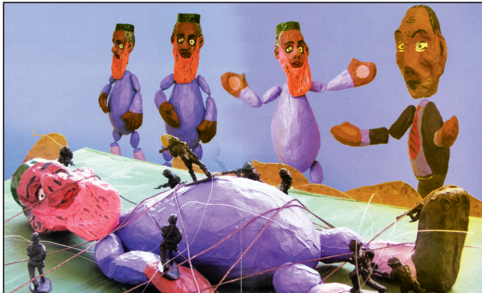
News at 10 -- puppet show performance

Among the many items of the installation was the Cockroach girl , made from calico fabric put together with latex glue. When Jessica came she wasn't used to cockroaches but after two months here she says she lives in harmony with them. "I realise now that they are just harmless creatures," she says. "It is related to other work that show that women are helpless. That's why I've depicted the insect as being on its back. I found that there are many women who spend their time mostly in the kitchen. They work very hard but they're not valued and don't have as much freedom as the men."