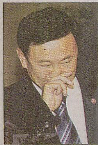
An emotional Thaksin before media