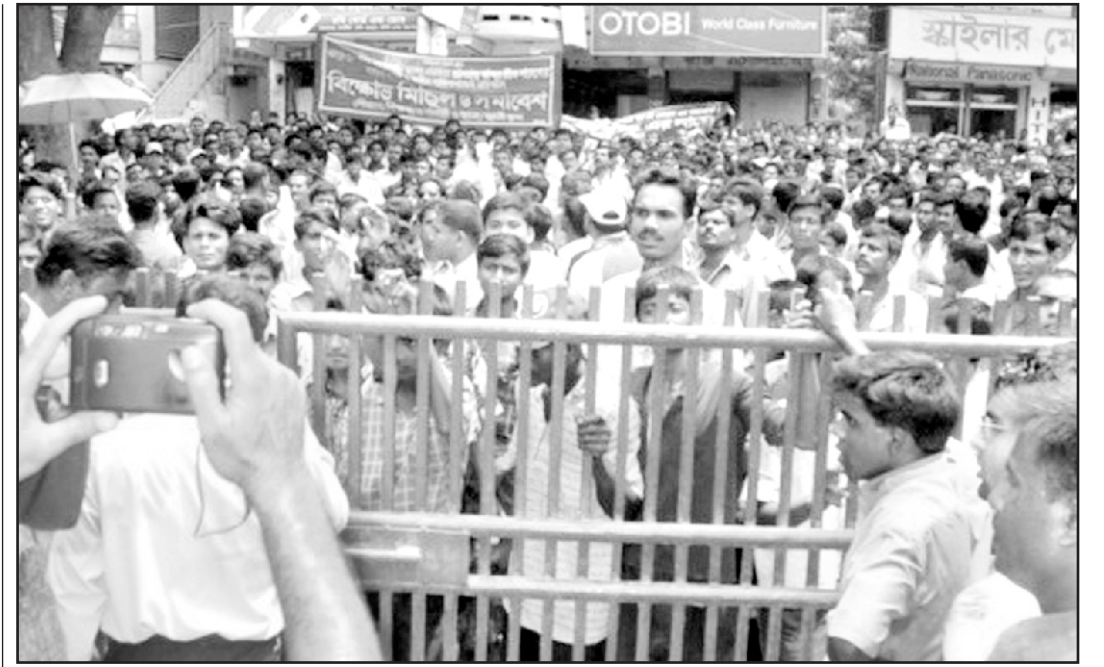
Crowds after the rally at Satkhira town gather in front of Deputy Commissioner's office to hand over a memorandum for arrest of the Jamaat MP.

Outlaws in the region are used by political parties during election, mainly to rig vote. They are also used for personal gains or hired for murder.