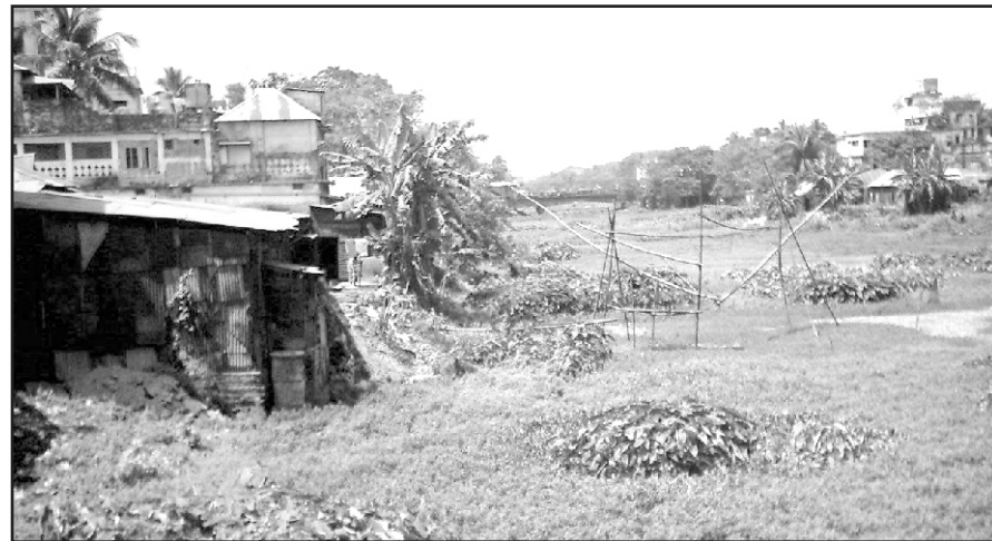
Houses being built on silted up Naroshonda river (left) and makeshift shops and structures on a bridge on the rivers in Kishoreganj town.