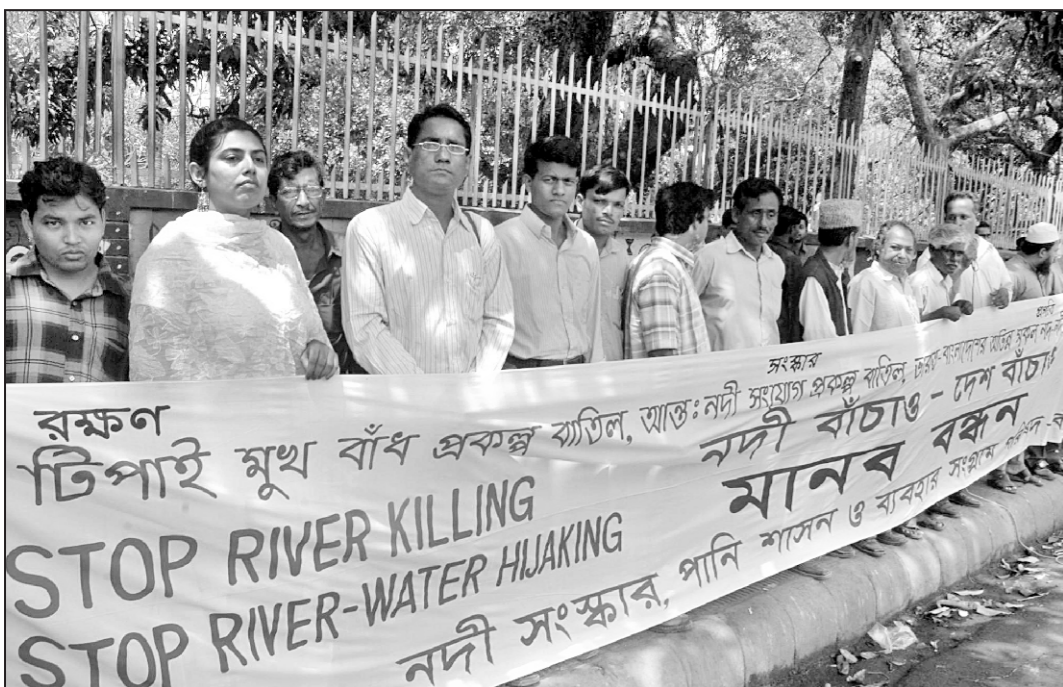
Nadi Sangskar, Pani Shasan O Babohar Sangram Parishad forms a human chain at Shahbagh in the city yesterday demanding cancellation of Tipai Mukh Dam Project and River Linking Project by India.

During the drive, the law-enforcers also seized seven firearms, two other weapons and 31 bullets, said a police headquarters release.