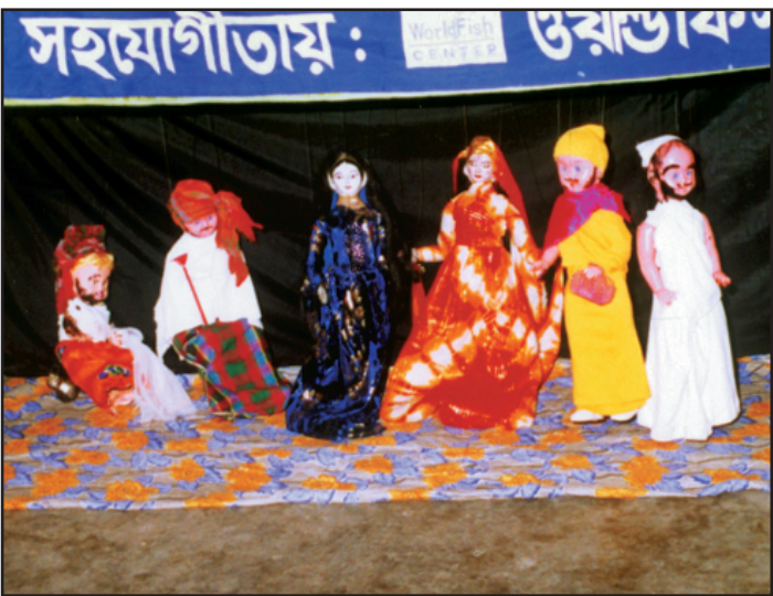
Puppets convey a social message

To generate awareness about the dangers of over-fishing, several media have been used. One innovative medium is puppetry, a versatile means of artistic expression, communication and instruction for 2,000 years. Puppets can both teach and persuade. Working the edge between entertainment and education, an organisation FemCom Bangladesh joined hands with the