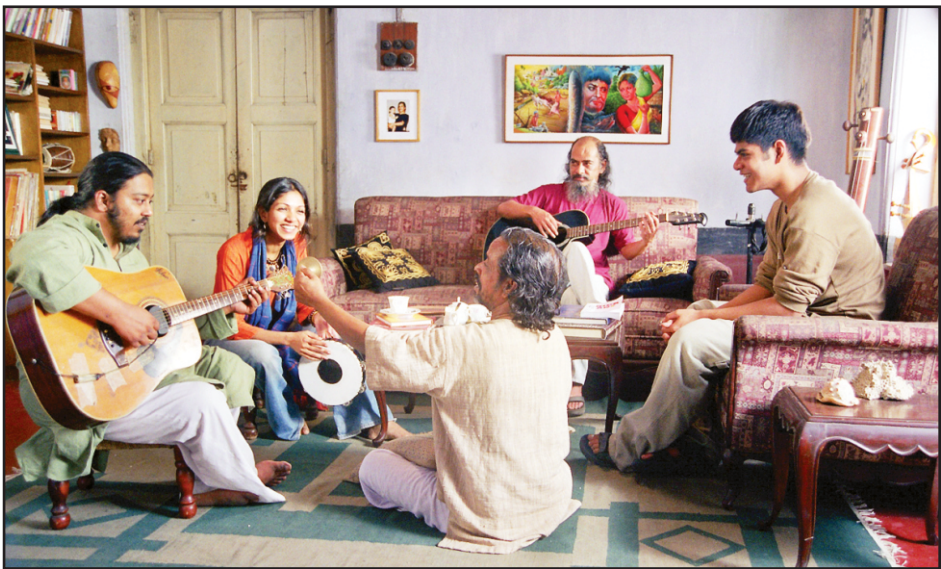
A scene from the movie

his motherland after receiving the news of his father's death. The story follows the transforming experience of Sohel as well as his divorced mother Shireen (Sara Zaker) as they, in their different ways, try to come to terms with this loss.