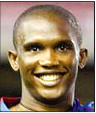
Samuel Eto'o (Barcelona star striker)

"For me, Ronaldinho is like my brother. To talk is very easy and to lie still easier. I have never had a problem with Ronnie because I admire him and I feel a co-contributor to his triumphs."